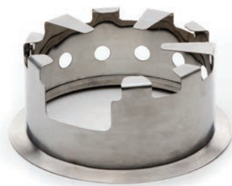
Made from Stainless Steel

Fits on the Fire Base of the Kelly Kettle. Small and large size available.