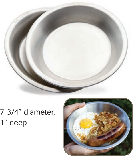
7 3/4" diameter, 1" deep

Dine in style with high quality food grade stainless steel camp plates. Set of 2 plates.