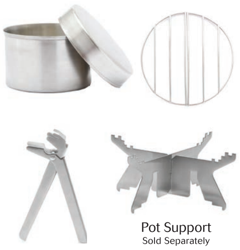
Pot Support Sold Separately

Cook Set includes: Pot and lid/frypan, Grill, and Gripper. Accessories are made from stainless steel. Pot Support Sold Separately